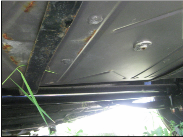
A shot of the underneath of the car. The floor pan may have been replaced.

With regard to the car, as you can see from these photos, the restoration was well under way and the workmanship was quite good from what I could see.