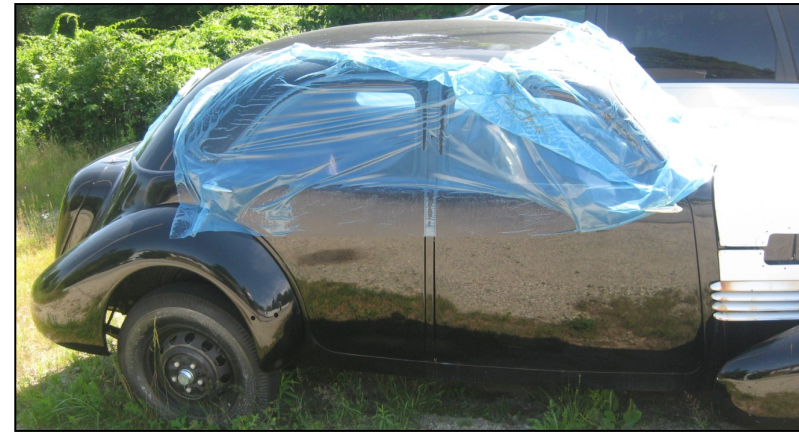
Overall body in good Condition as you can see from the passenger side view.