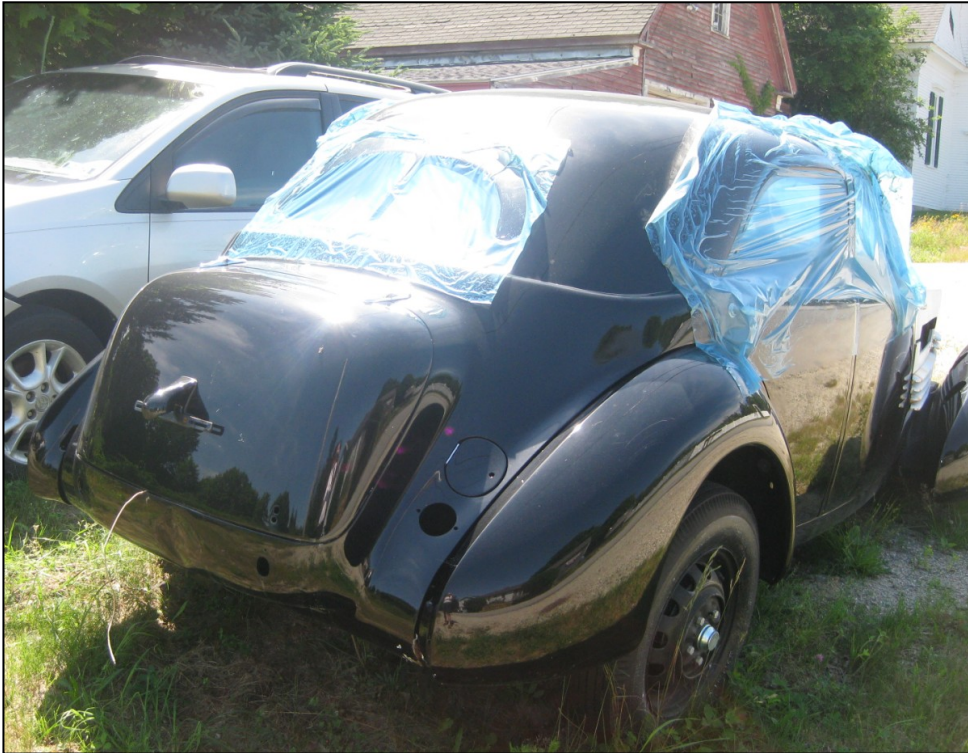
1936/37 810 Bustle Back Cord Beverly

Having a little free time on our hands, my son and I took a little trip around the country side. About a mile or so from the house, we made a left turn and there it was, the barn find of a lifetime, at least in my eyes. Parked on the side of the road in front of an old farm house was a 1936/37 810 Bustle Back Cord Beverly.